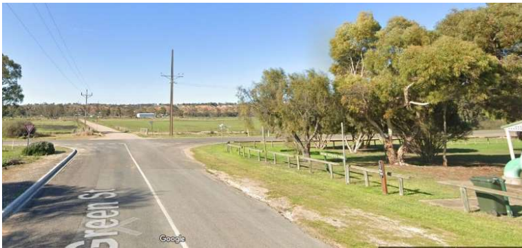
Mypolonga town edge before the flood. The tree line in the far distance is the river's edge