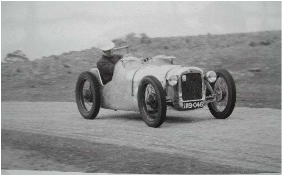
Terry IRELAND AUSTIN 7