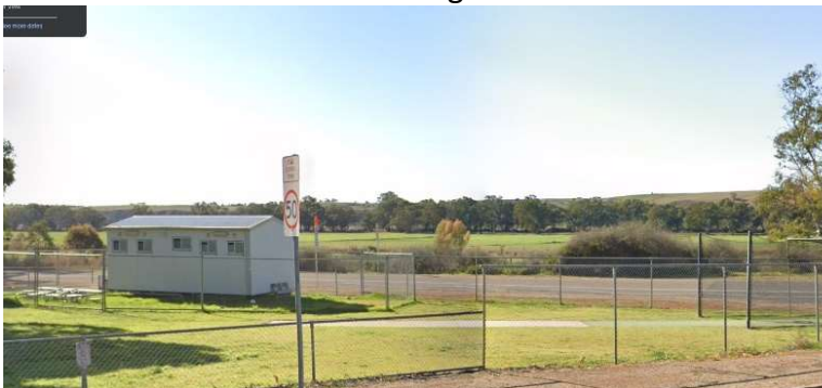
Mypolonga School Cricket Practice Pitch Before the Flood