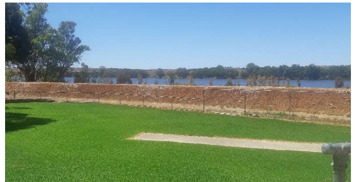
At least the damp soil has greened the turf.