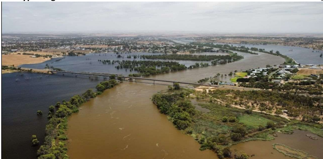
Looking up-river towards Murray Bridge, Swanport Bridge (Highway 1) in the foreground