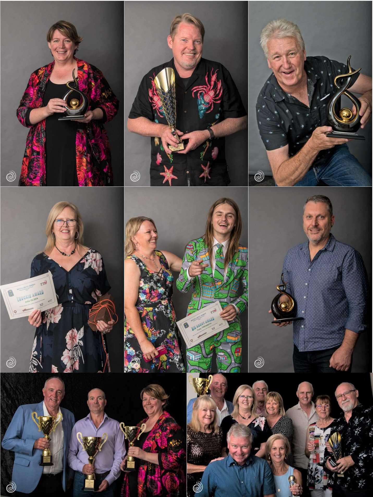
A selection of trophy winners at the TTM Awards night.