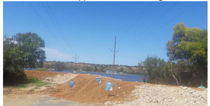
Mypolonga approx. the same position Note the farm shed in the centre of the photo