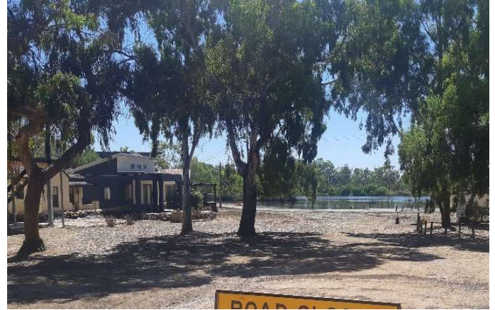
Caloote After the Flood. The dark line on the road just above the Road Closed sign is the high water mark, The houses appear to be undamaged.