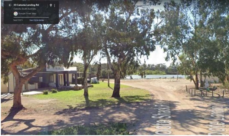
Caloote Before the Flood. The tree on the left is a reference point.