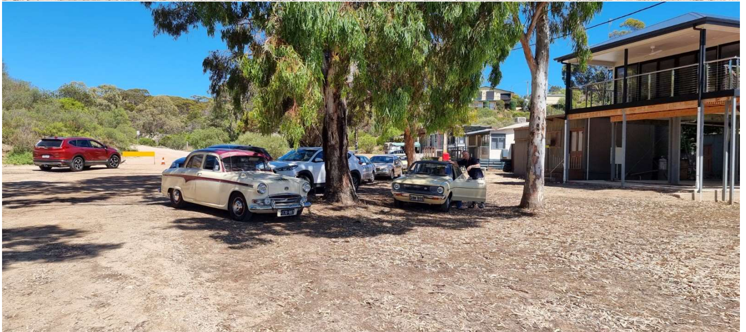
Above: A general view of Caloote and below, at Aussie Apricots Mypolonga.