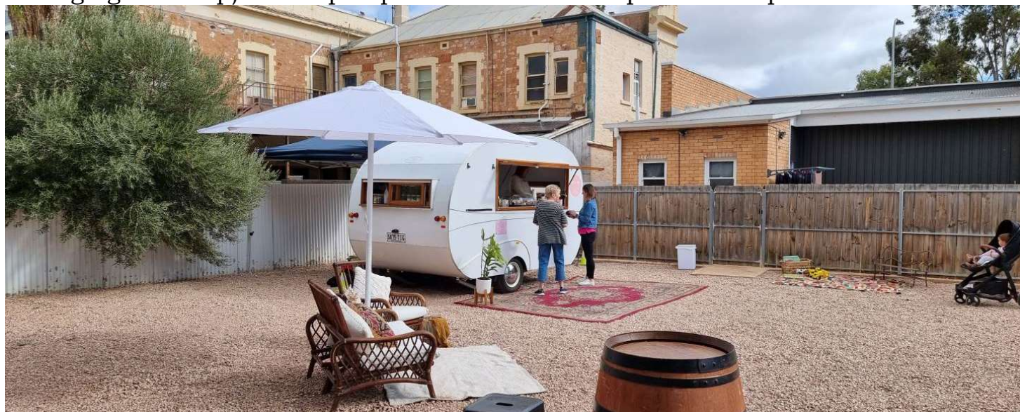
In a backyard in Crystal Brook was a coffee van serving the locals, so we joined in!