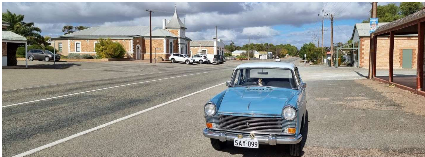
Stopped in the main road in Yacka.

The theme for our trip to Port Pirie and environs on 16 to 20 May 2022 was to visit localities or towns that are not normally stopped at when travelling in the mid north of the state. With this in mind, the only organisation was the accommodation at Bentley’s Cabin Park at Port Pirie and each evening meal at Sporties Tavern across the road. We had 15 cabins booked in the end where our group of 28 was accommodated. In the preamble to the Run, it was stated that it was desirable that we used vehicles that we were comfortable with, which resulted in 2 Austin 16’s, A95. 2 Austin Freeways, a Holden Deville Magnum, a Mercedes, a Datsun 120Y, a Porsche 911, and a host of moderns taking to the roads. Our route on Day 1 Monday 16 May was via Roseworthy, Sevenhill (lunch), Clare, and Yacka, to Port Pirie and our first happy hour. A late cancellation by Bill Gower with his daughter Suzanne and husband Phil was due to a late minute COVID infection within their family. Bill was not happy to say the least!