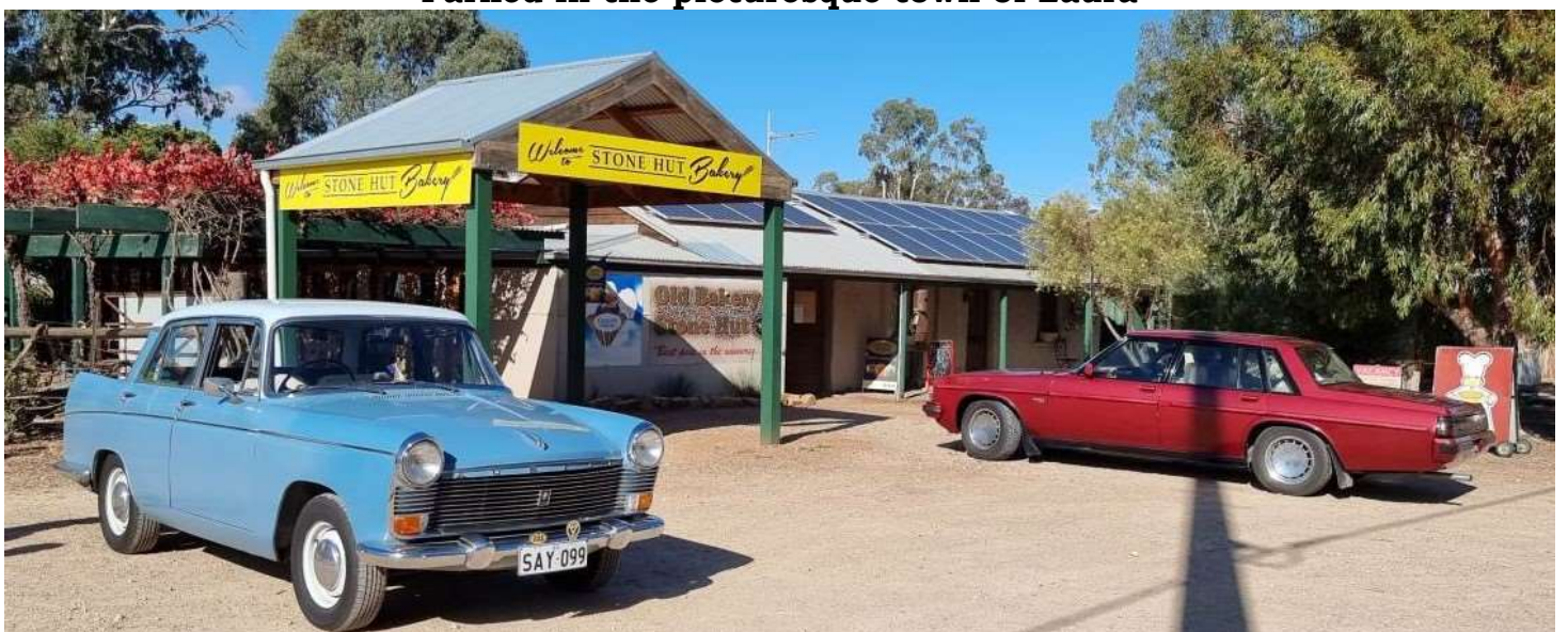
Outside the Stone Hut Bakery well renowned for its selection of gourmet pies.

Heading back to Port Pirie via Wirrabara and the Silo Art, then via Port Germein Gorge and Highway A1 to Bentley's Cabin Park and our second happy hour.