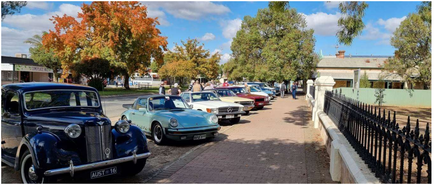
Parked in the picturesque town of Laura