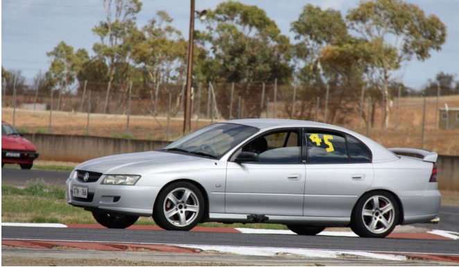
#45 Oliver JAENSCH