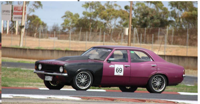
#69 Colin TUCKER