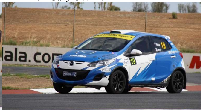
#19 Fiona McCUBBIN-MEE