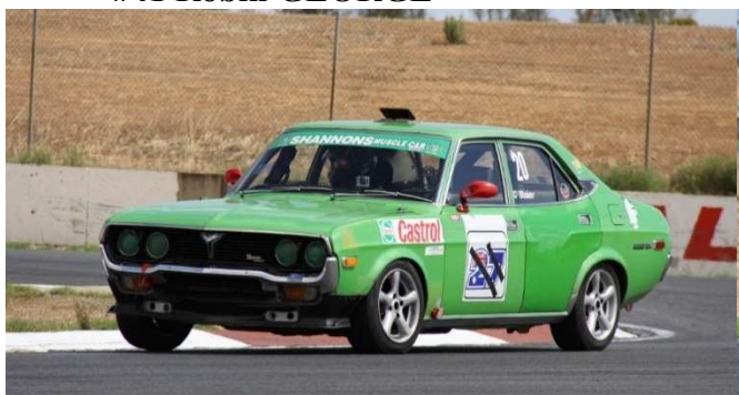
#20 Craig BLAKER