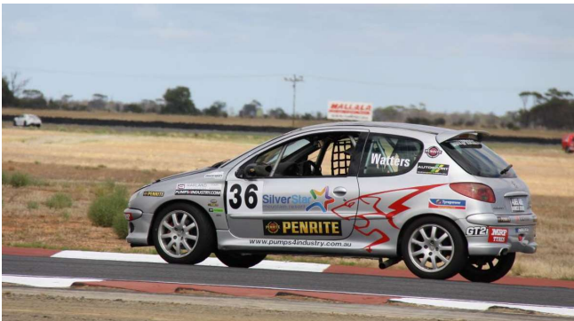
#36 Sandy WATTERS