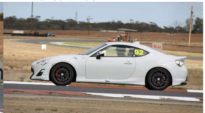
#92 Gary OWEN