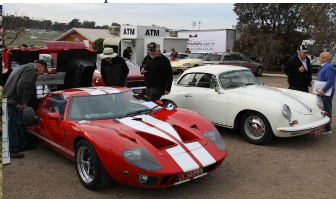
A piece of "garden art" featured in the back car park along with some more respectable vehicles.