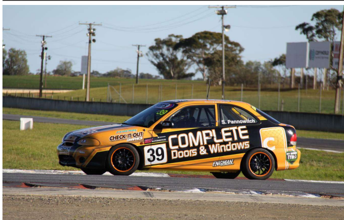
#39 Asher JOHNSTON