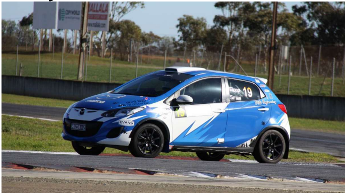
#19 Fiona McCUBBIN-MEE