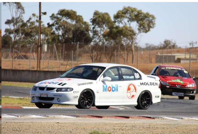
#68 Gavin LYMN