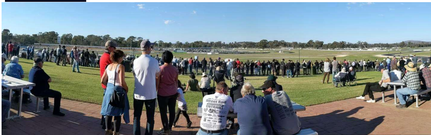
A general view of the Winton Track on the Saturday.

South Australian Austin 7 Club members as usual, supported this event with at least 12 members making an appearance either as an entrant or just as a spectator.