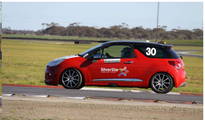
#30 Brett WATTERS