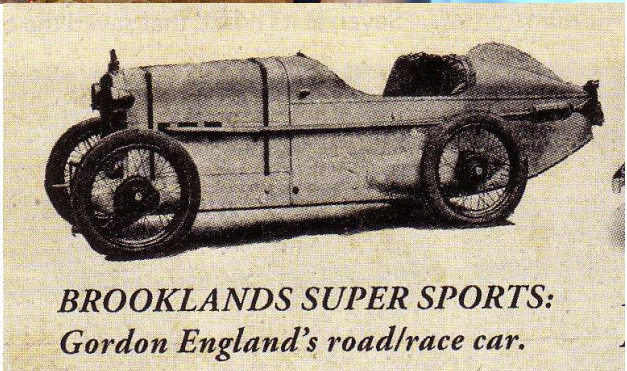
BROOKLANDS SUPER SPORTS: Gordon England's road/race car.