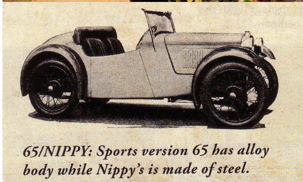
65/NIPPY: Sports version 65 has alloy body while Nippy's is made of steel.