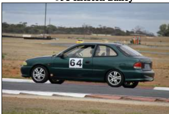
#64 Dylan Flego