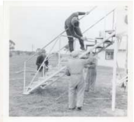
6 Stairway to heaven.