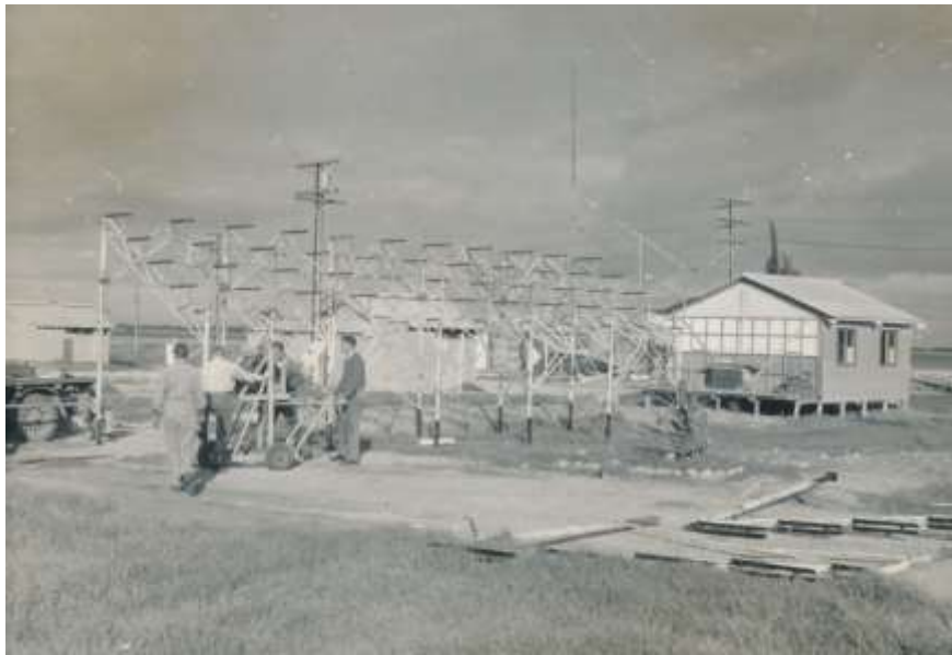
7 Look what we've done Mum!!