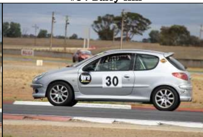
#30 Brett Watters