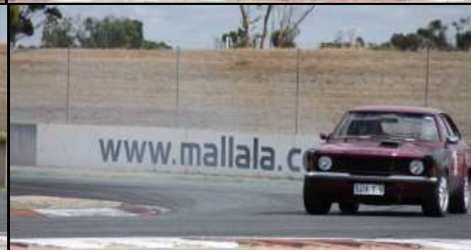
#69 Colin Tucker looking as though he was heading for trouble with a bit of understeer.