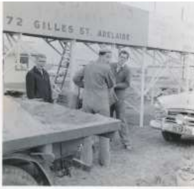
5 Advertising sign ready for business!