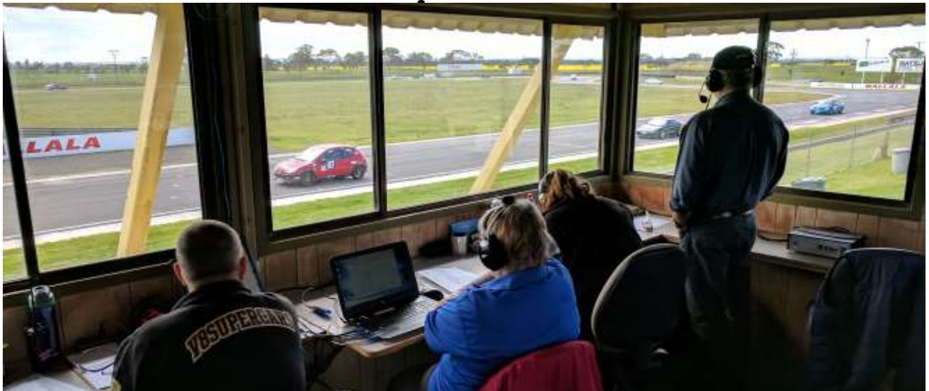
The view from inside the Mallala Timing Tower with the Austin 7 Timing Team in action.