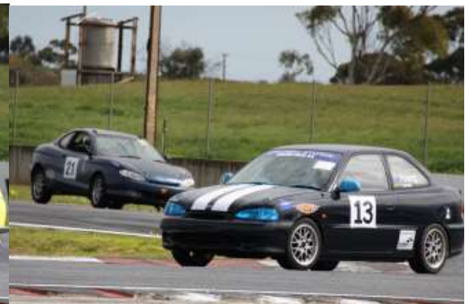
21 - Colin GENDERS & 13 - Brett FOREST