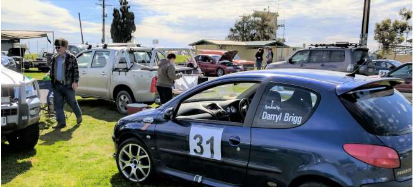
In the pits at Mallala.