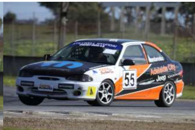
Leon BONDARENKO - HYUNDAI EXCEL