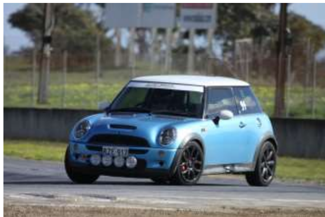
Matthew GOLD - BMW MINI