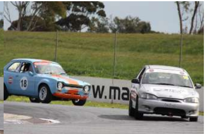
18 - Graham MODRA & 16 - Paul WISE