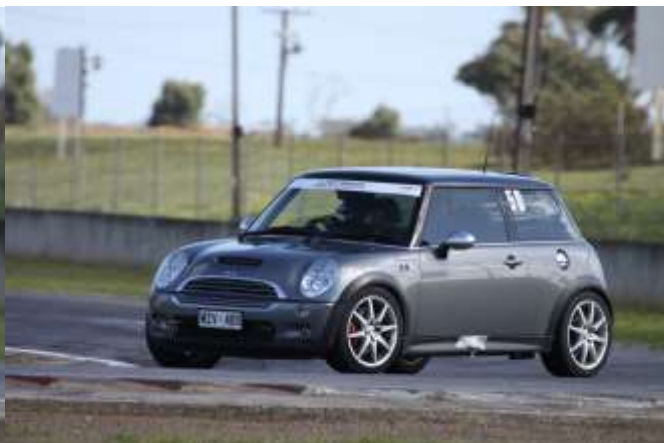
Rob SKINNER - BMW MINI