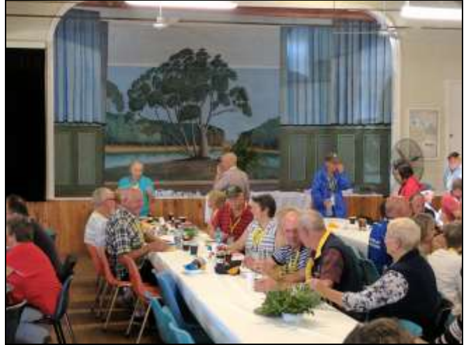
Day 4 Tuesday 11 April, drive to Jondaryan Woolshed for morning tea