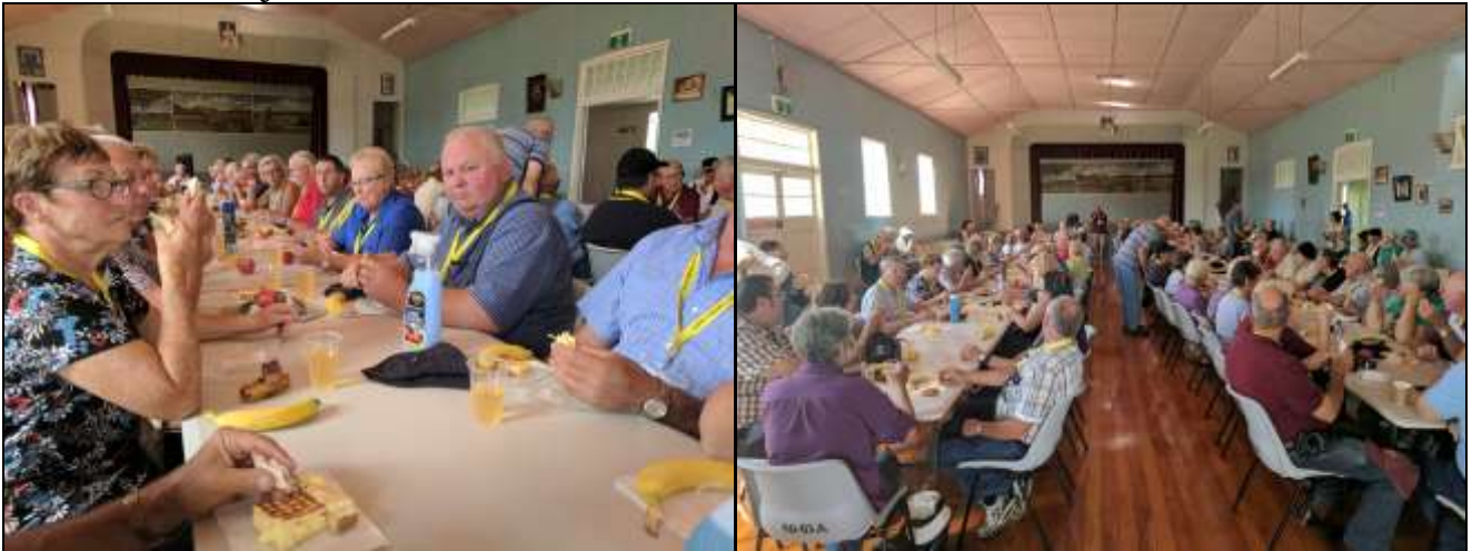
Day 6 Thursday 13 April to Pittsworth Showground for morning tea & gymkhana & Pittsworth Historical Village for lunch.