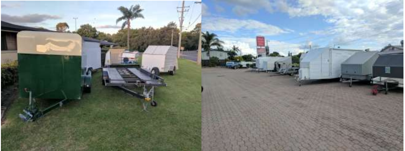
Trailers parked at Toowoomba Motel and Ipswich Motel

Trailer parking at motels was sometimes challenging but we prevailed: