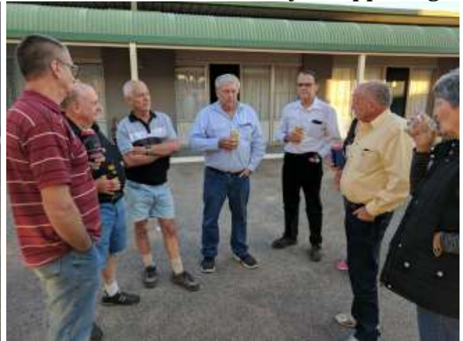
At Broken Hill: