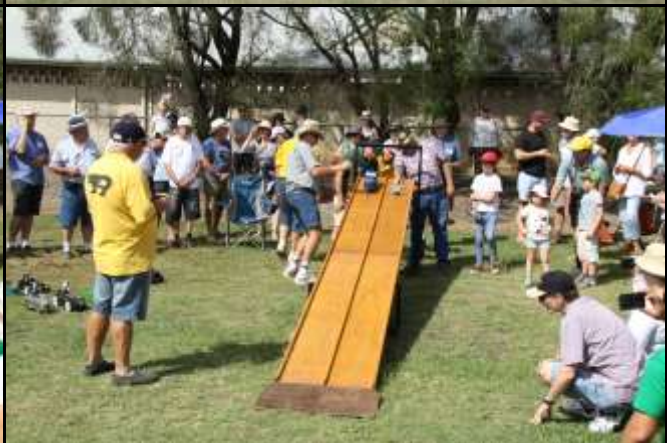
Rocker Cover Races (above)