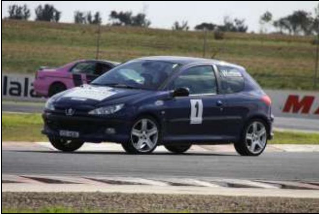
1: Sandy WATTERS