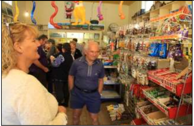
LUNCHTIME STOP AT BURRA GORGE