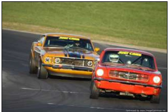
Late afternoon and the final race at Winton 2016