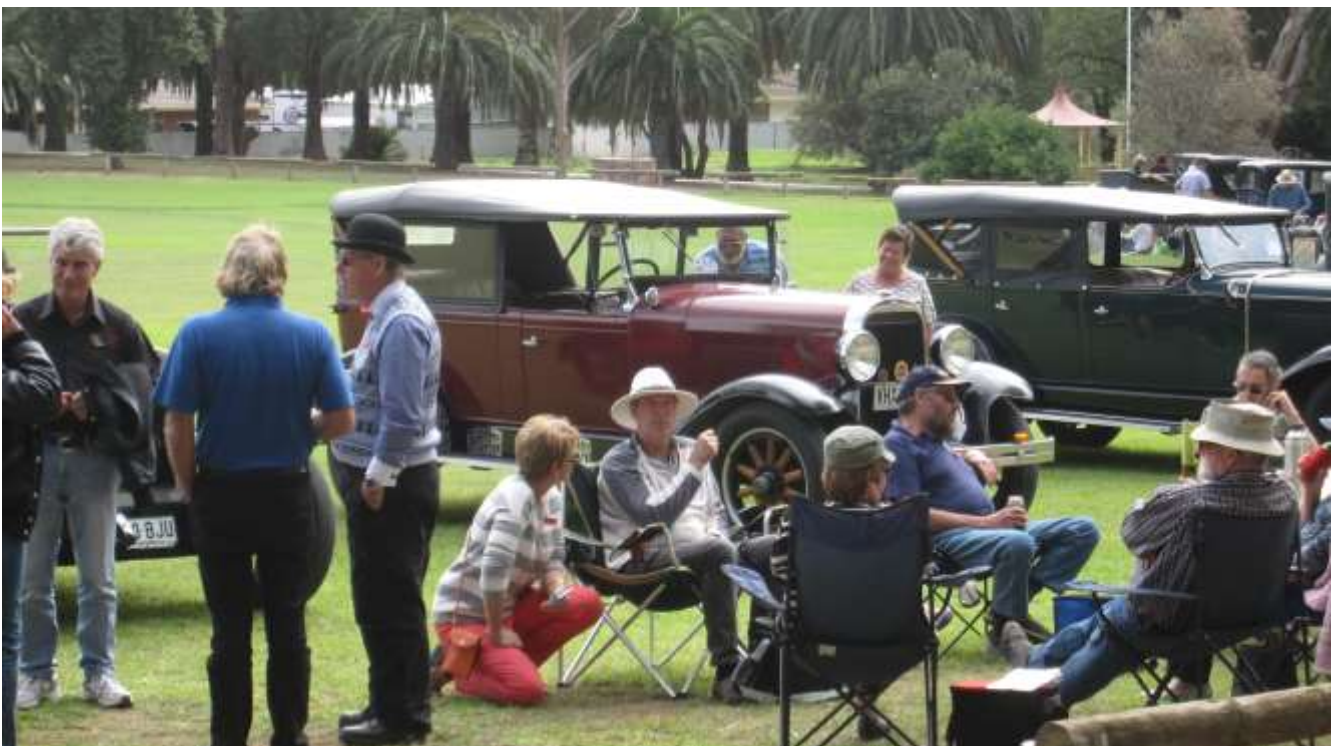
Participants enjoying conversation at Greenock Oval.