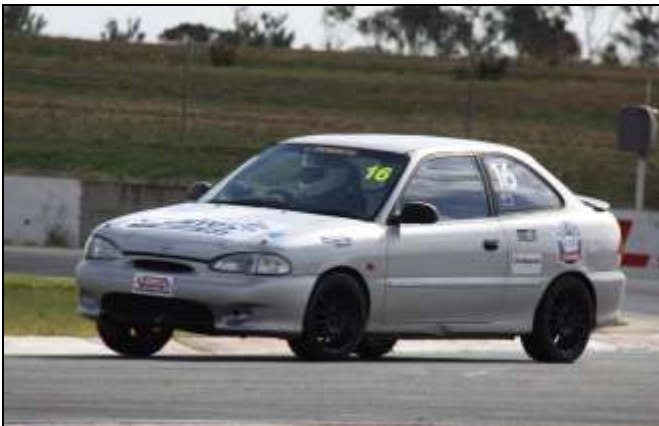
5: Paul WISE