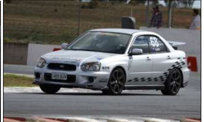
4: Gavin LYMN