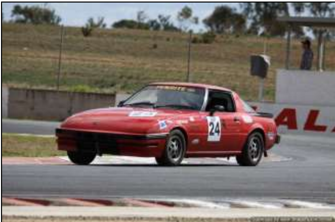
7: Stephen DRURY