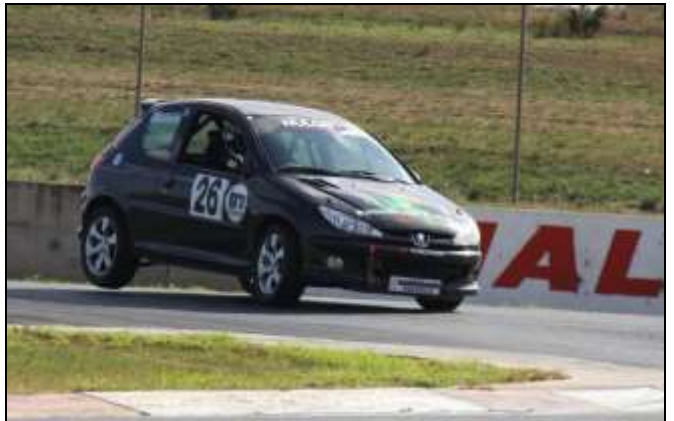
8: Brett WATTERS