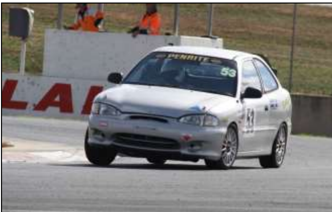
7: Jason THIELE