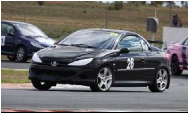
1: Brett WATTERS