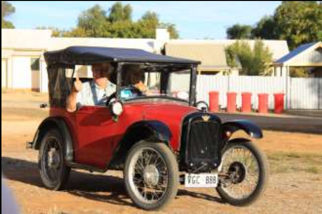
DOING A DRIVE BY AT THE HAPPY HOUR