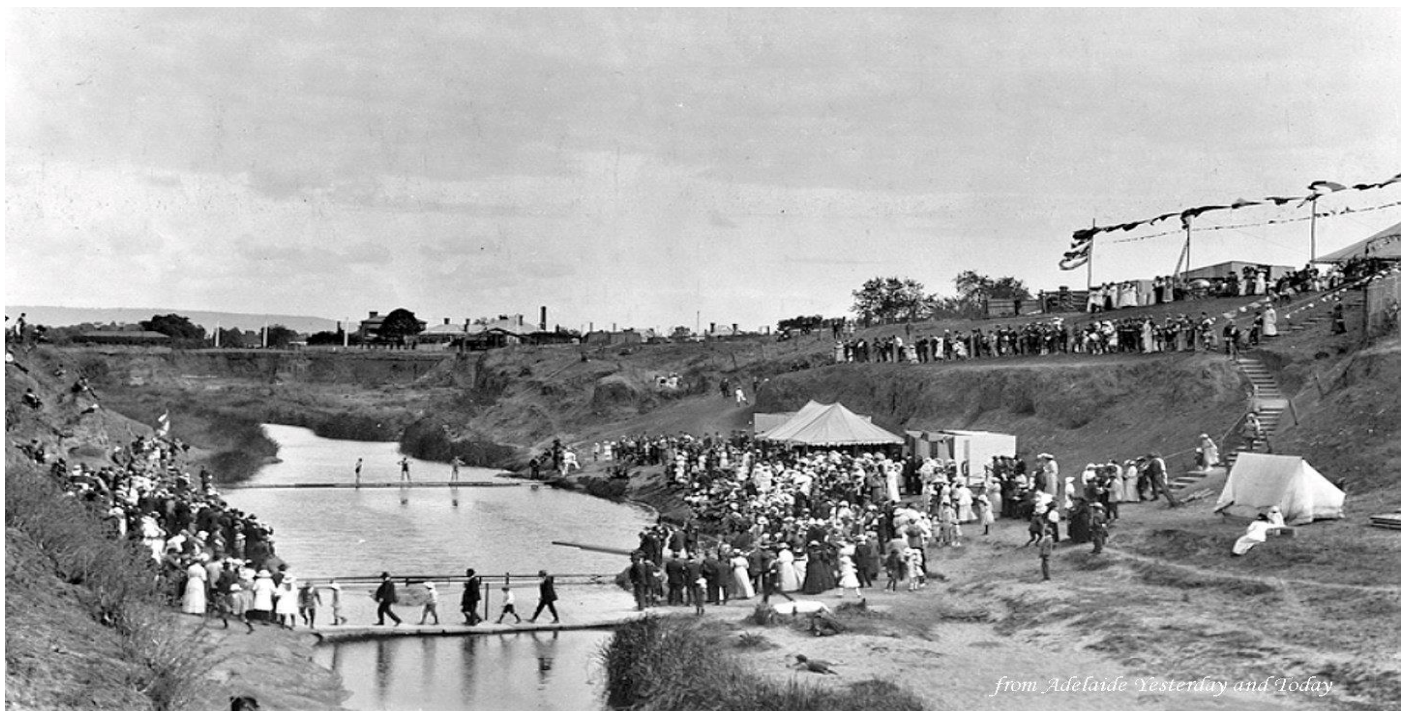
Gilberton Amateur Swimming Club