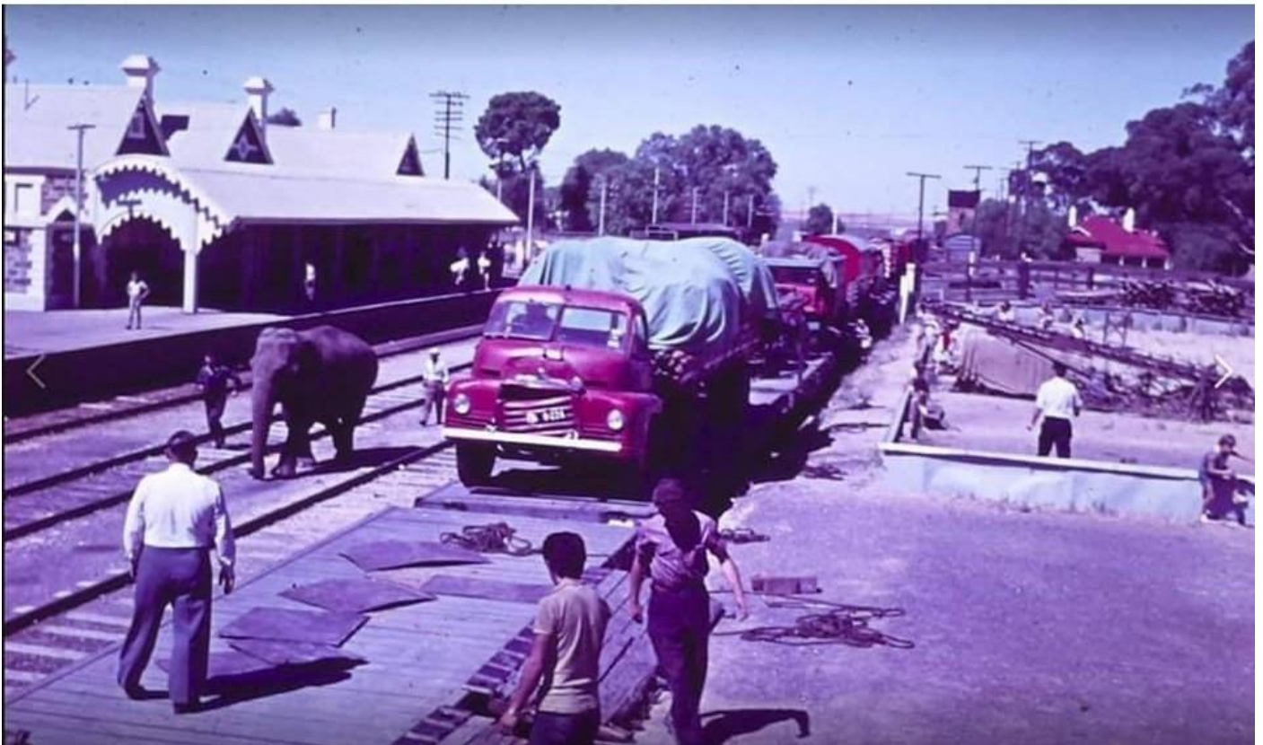
Burra Railway Station 1960's