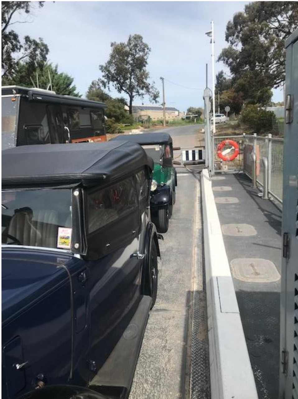
Crossing the ferry at Wellington on Day 1

The event is held every year with members from the South Australian club meeting with members from the Victorian Club Somewhere along the Border. This year the venue was Mount Gambier and 47 enthusiasts participated.