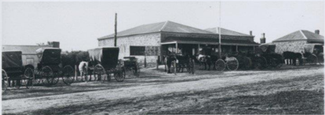
WJ Phillip's Store Callington 1898