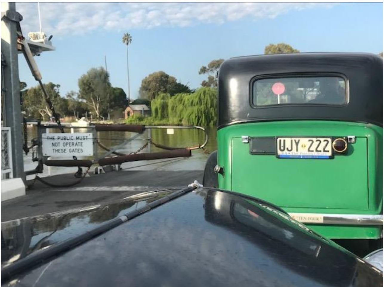
Back on the Wellington Ferry on the way home.