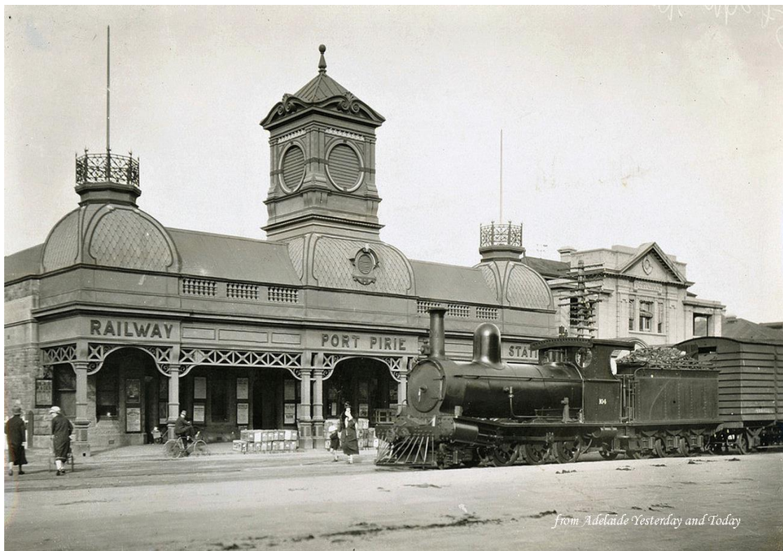
Port Pirie 1930