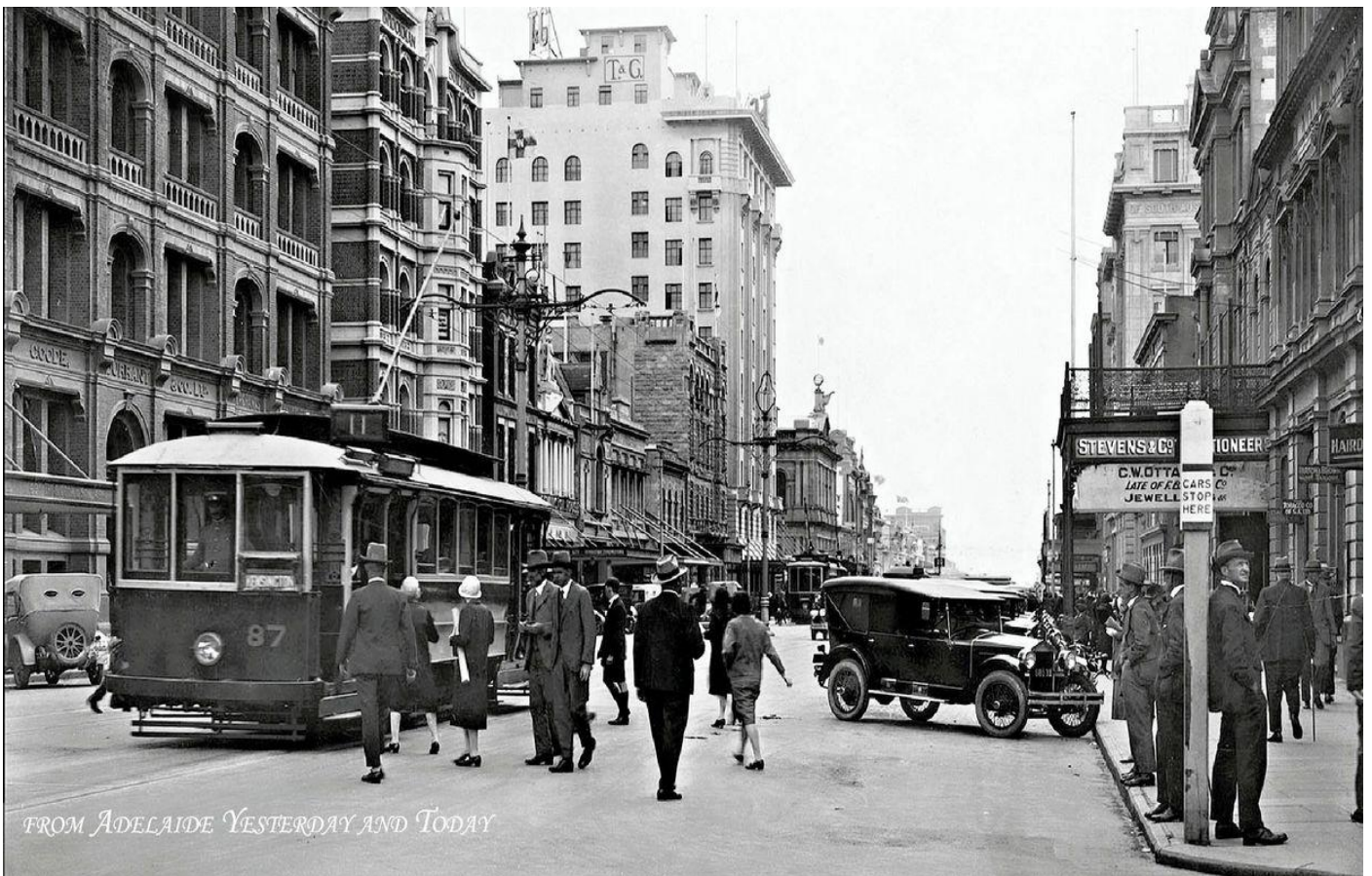
FROM ADELAIDE YESTERDAY AND TODAY