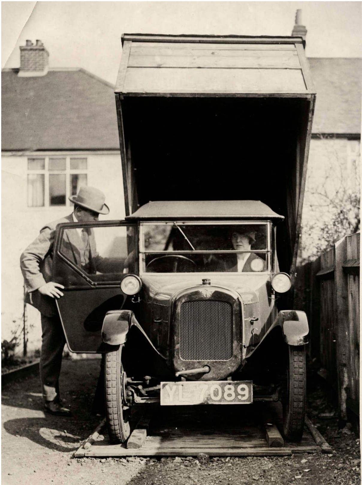
Flip up garage