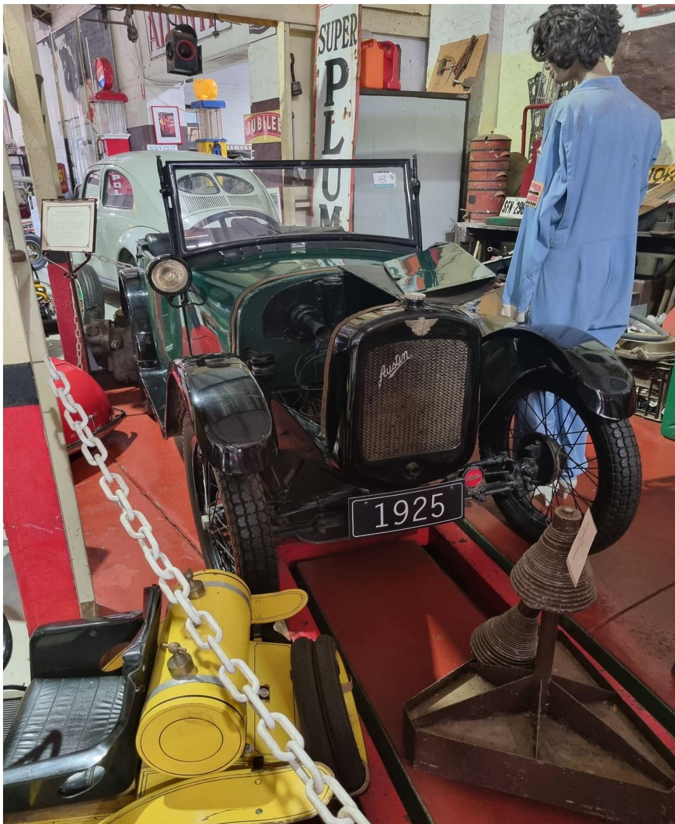
1925 at the York Motor Museum