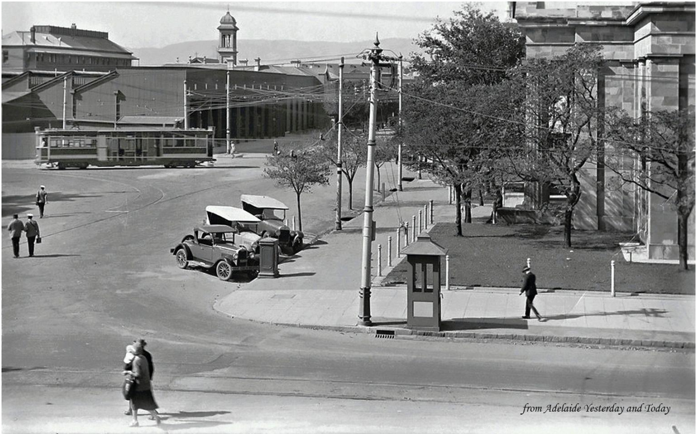
Angas St 1929 Tram Depot in the background