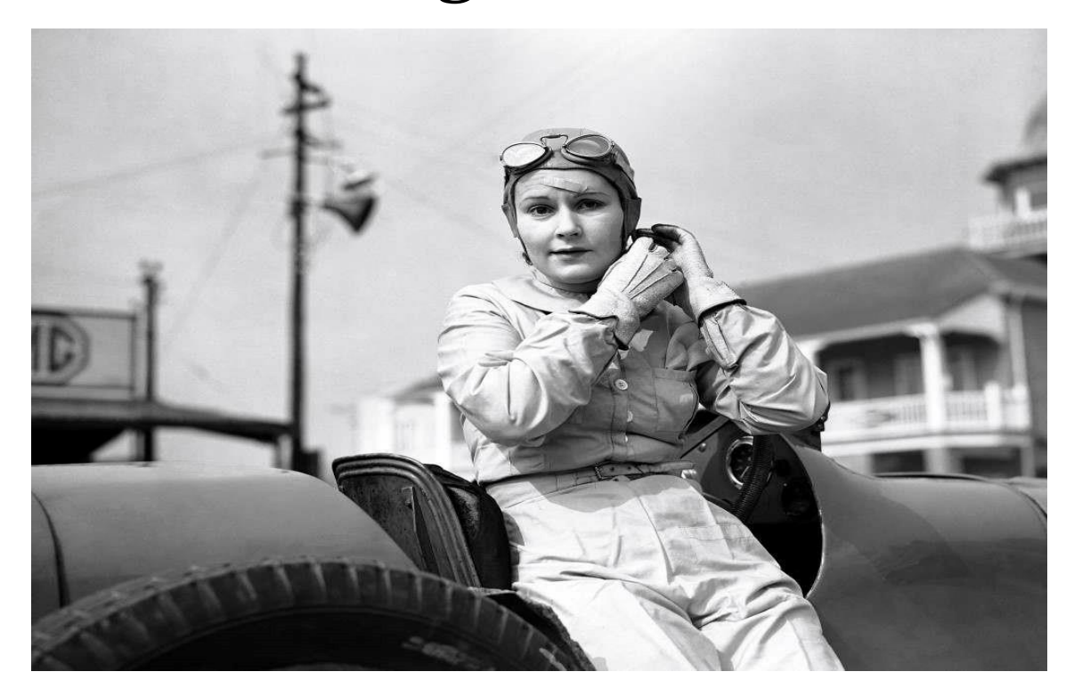
Sillier than a Seven