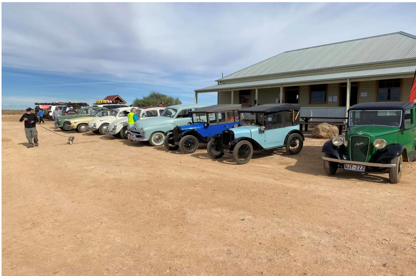
Farina Bakery Tuesday 20.6.23