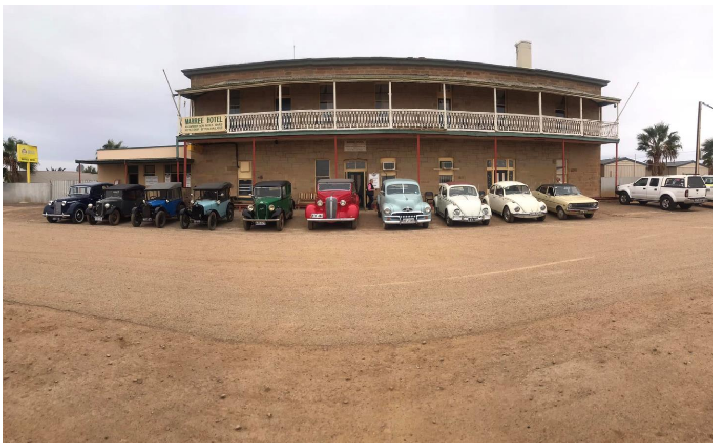
Made it to Marree Tuesday 20.6.23.