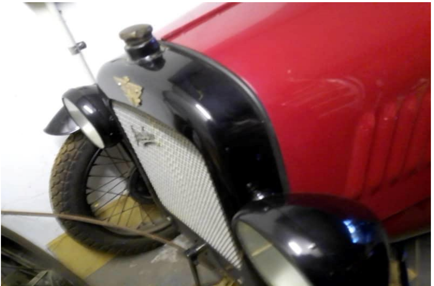
Austin 7 Ace Sports 1929 | Cars, Vans & Utes | Gumtree Australia Monash Area - Mount Waverley | 1313375562