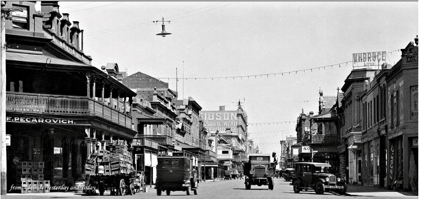
February 1928 The Stagg Hotel