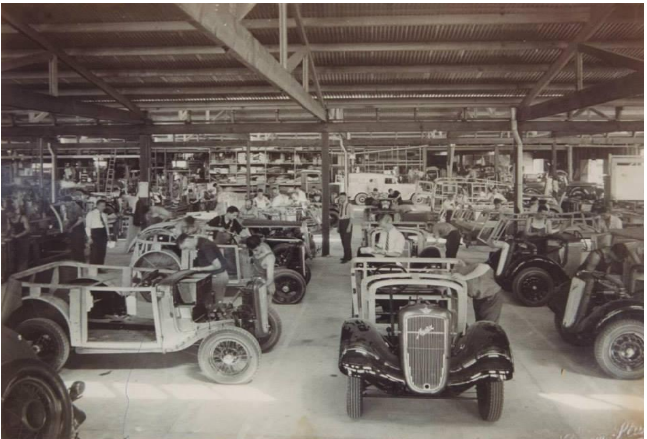
Hope Body Works Fortitude Valley Queensland 1935