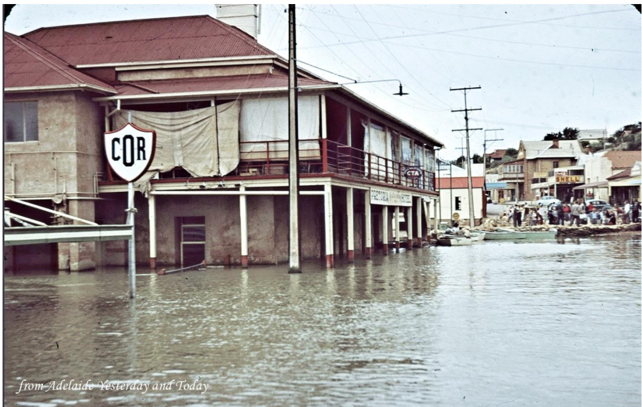
Mannum August 3 rd 1956