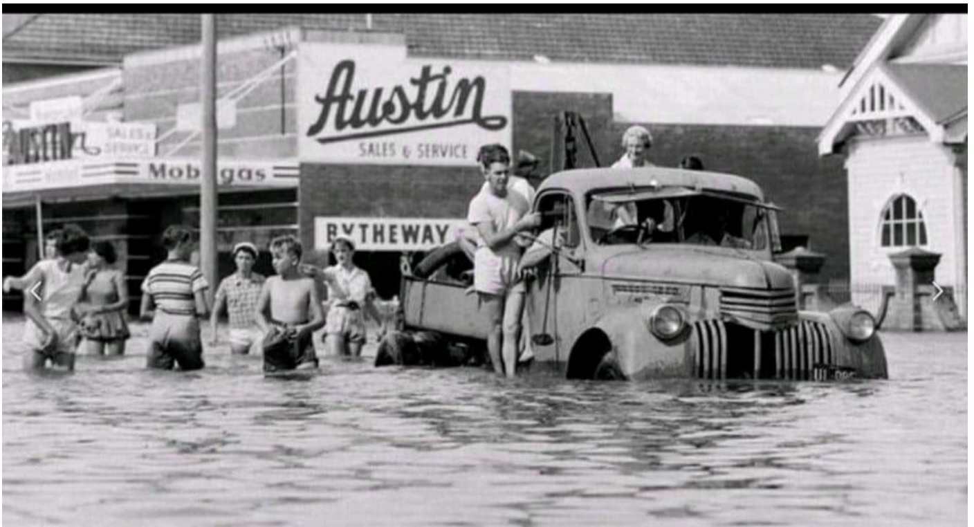
Austin agent in the Lismore floods 1954