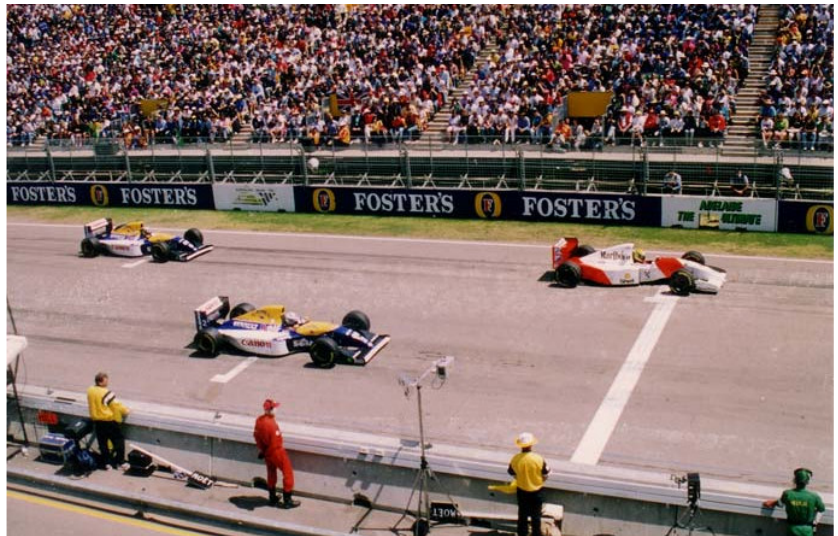
Start of the 1993 AGP. Cars of Ayrton Senna (1), Alain Prost (2) and Damon Hill (3).