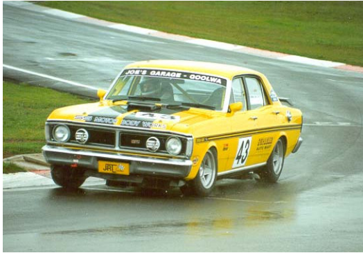
Rob Vanderkamp at the wet September 1997 Mallala Masters meeting.