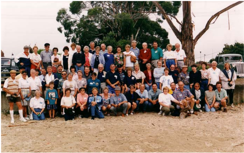
The Tasmanian tour party, March 1995

emphasis was on longer runs which featured an element of discovery of scenery and history.