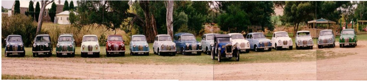
A30's assembled at Angaston, 21-3-93