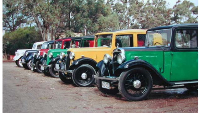
A10's big day out, Meadows, 15-8-93