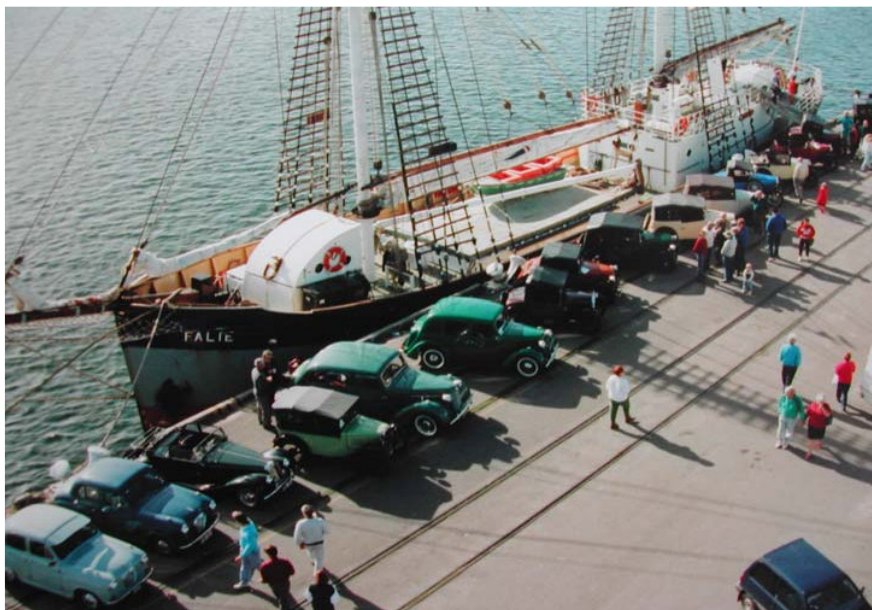
Cars assembled on the wharf at Outer Harbor, alongside the "Falie", after a suburban run in 1993.